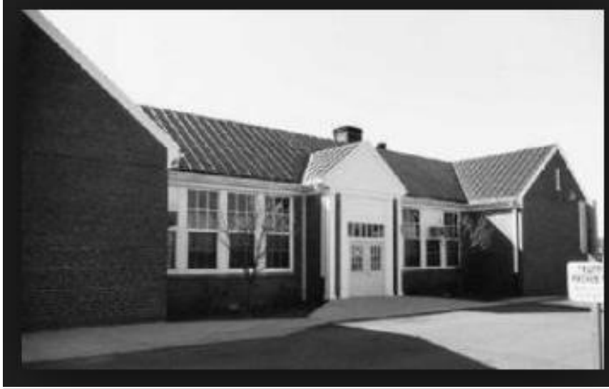
Frederick Douglass High School, opened in 1941

The fight for equal rights took decades. Not until the 1930s and 1940s did the County begin to improve schools for black children, and that was against stiff white resistance. Even after the U.S. Supreme Court in Brown v. Board of Education (1954) finally shattered the legal basis for segregated public schools, the Loudoun County government initially followed the lead of Virginia Sen. Harry F. Byrd, Sr. in his “Massive Resistance” campaign against school integration. Despite repeated court orders the County did not fully desegregate its schools until 1968-1969. The vestiges of Jim Crow discrimination persisted in other areas of everyday life, such as theaters and restaurants, but passage of the 1964 Civil Rights Act and 1965 Voting Rights Act -- a full century after the Civil War -- at last guaranteed federal protection of these privileges for all of Loudoun’s citizens.