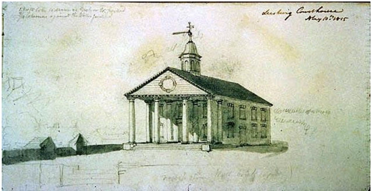
Second Leesburg Courthouse, 1815