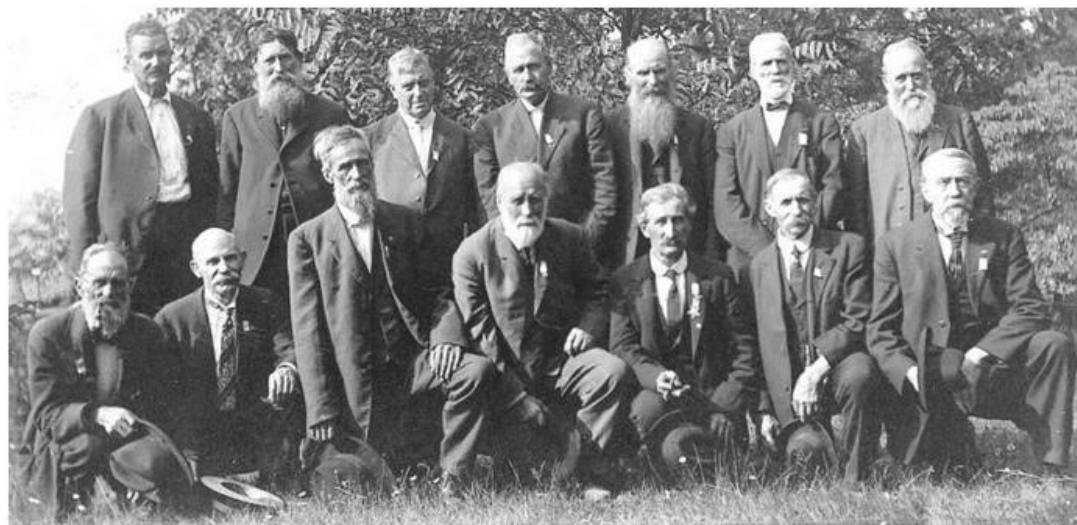
Loudoun Rangers Reunion, Waterford, 17 Sept 1910

Like the neighboring northern counties of Virginia that would soon break away to form West Virginia, Loudoun was bitterly split over secession. In some northern and western areas (Waterford, Lovettsville, Hamilton), support for the Union remained strong, but after Fort Sumter, over two-thirds of the County voted to ratify secession in May 1861 (1,626-726). The scene was set for internecine warfare as communities and families fractured over competing loyalties to North and South.